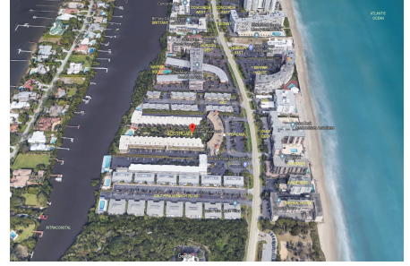
Built in 1974 - 128 units - 5 floors

Southgate Condominium Association Inc 3605 South Ocean Boulevard Office South Palm Beach, FL 33480 (561) 588-0153