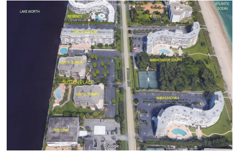
Built in 1981 - 76 units - 5 floors

Sutton Place Condominium Address: 2778 S Ocean Blvd, Palm Beach, FL 33480, Phone: +1 561-588-1665