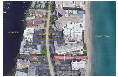
Built in 1982 - 120 units - 10 floors

Thirty-Five Sixty Condominium 3560 Condominium Associates Inc 3560 South Ocean Boulevard Palm Beach, FL 33480 Phone: (561) 588-2323