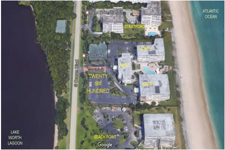
Built in 1977 - 81 units - 5 floors

2600 Condo Address: 2600 S Ocean Blvd, Palm Beach, FL 33480, Phone:+1 561-585-3189