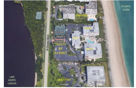
Built in 1977 - 81 units - 5 floors

2600 Condo Address: 2600 S Ocean Blvd, Palm Beach, FL 33480, Phone:+1 561-585-3189