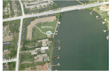
Built in 1966 - 35 units - 2 floors

White Hall Condominiums Property Manager 561-427-0681 561.427.0696 http://bristolmanagement.com/forms/Whitehall/whitehall.htm