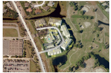
Built in 2005 - 112 units - 3 floors