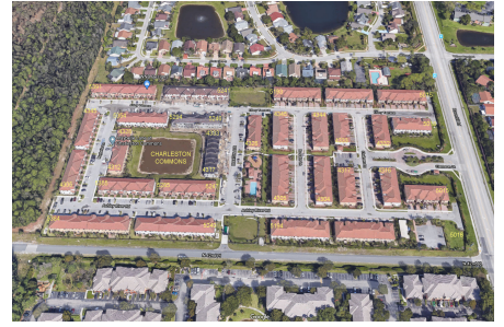
Built in 2014/2017 - 239 units - 2 floors