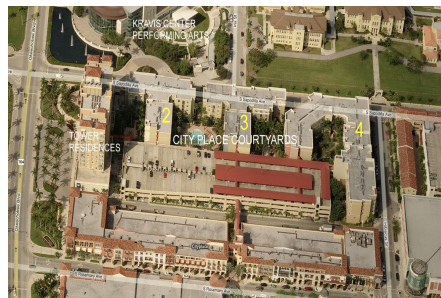
Built in 2000 - 264 units - 5 floors

Courtyards In City Place Condominium Assoc 720 Sapodilla Avenue West Palm Beach, FL33401 (561) 655-3512