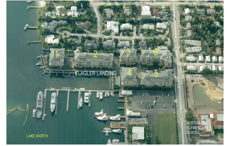
Built in 2007 - 68 units - 4 floors

Flagler Landing Condominium Association, Inc 325 Clematis Street # 100p West Palm Beach, FL33401 (561) 882-4450