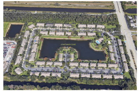
Built in 2002 - 264 units - 2 floors

Jonathan's Cove HOA c/o GRS Community Management 3900 Woodlake Blvd. Suite 309 Lake Worth, FL 33463 TEL: 561-641-8554 FAX: 561-641-9448