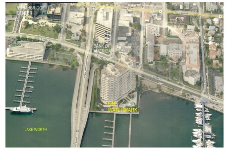
Built in 2003 - 48 units - 14 floors

One Watermark Place Of The Palm Beaches Condominium Association, Inc 622 N Flagler Drive West Palm Beach FL 33401-4010 (561) 472-0860