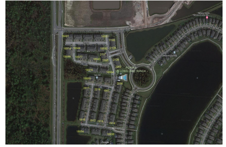
Built in 2015/2018 - 197 units - 2 floors

https://www.longlakeranchhoa.com/contact.php https://www.longlakeranchhoa.com/default.php