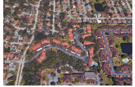
Built in 1981/1987 - 88 units - 2 floors