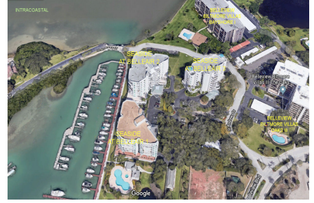
Built in 1995 - 60 units - 9 floors

Seaside At Belleair Master Association, Inc 7300 Park Street Seminole, FL 33777 Phone: (727) 581-2662