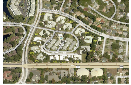
Built in 1981 - 112 units - 1 floor

BRYN MAWR AT COUNTRYSIDE CONDOMINIUM ASSOCIATION, INC. PROGRESSIVE MANAGEMENT, INC. 4151 WOODLANDS PKWY PALM HARBOR FL 34685 727-773-9542