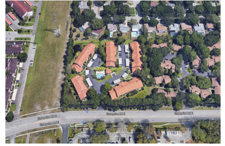
Built in 1984 - 44 units - 2 floors

Europa Of Countryside Condominiums Address: 2620 Enterprise Rd E, Clearwater, FL 33759