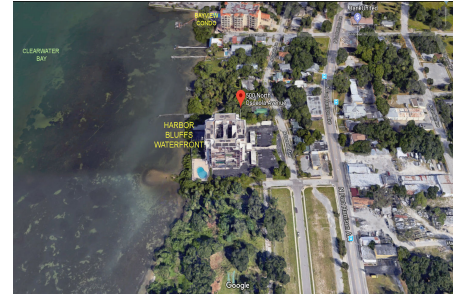
Built in 1974 - 78 units - 3 floors