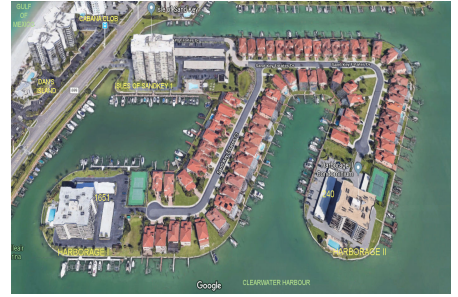
Built in 1982 - 128 units - 8 floors

Number of units: 128 Number of active listings for rent: 1 Number of active listings for sale: 2 Building inventory for sale: 1% Number of sales over the last 12 months: 5 Number of sales over the last 6 months: 3 Number of sales over the last 3 months: 3