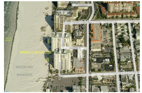
Built in 2002 - 91 units - 16 floors

Mandalay Beach Club Owner's Association, Inc 10 Papaya Street Clearwater Beach, FL 33767 Phone: (727) 449-8852 (727) 442-8819 Fax: (727) 442-8859 http://mbcmanager@themandalaybeachclub.com