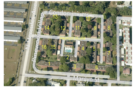
Built in 1978 - 111 units - 1 floor

PINEWOOD VILLAGE CONDOMINIUM ASSOCIATION, INC. HOLIDAY ISLES PROPERTY MANAGEMENT INC 11350 66TH ST STE 124 LARGO FL 33773 727-548-9402