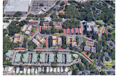
Built in 1972 - 370 units - 8 floors

Seville Condo Association ADDRESS 1001 Pearce Dr Clearwater FL 33764-1145 PHONE (727) 712-3137