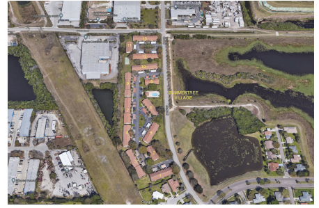
Built in 1982/1997 - 84 units - 2 floors

Number of units: 84 Number of active listings for rent: 0 Number of active listings for sale: 0 Building inventory for sale: Number of sales over the last 12 months: 0% Number of sales over the last 6 months: 3 Number of sales over the last 3 months: 2