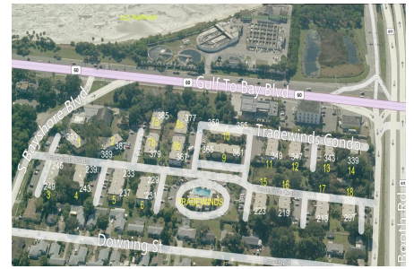
Built in 1974 - 204 units - 2 floors

TRADEWINDS EAST CONDOMINIUM ASSOCIATION 251 S McMullen Booth Rd Clearwater, FL 33759-4425 (727) 585-3491