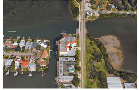
Built in 2005 - 24 units - 4 floors