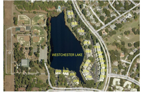
Built in 1983 - 125 units - 2 floors

Number of units: 125 Number of active listings for rent: 0 Number of active listings for sale: 3 Building inventory for sale: 2% Number of sales over the last 12 months: 1 Number of sales over the last 6 months: 1 Number of sales over the last 3 months: 0