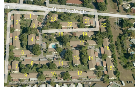
Built in 1979 - 152 units - 1 floor

WOODLAND VILLAS CONDOMINIUM I ASSOCIATION, INC. PROGRESSIVE MANAGEMENT, INC. 4151 WOODLANDS PKWY PALM HARBOR FL 34685 PHONE 727-773-9542 FAX 727-773-8740 HTTP://WWW.PROGRESSIVEM.COM/PROGRESSIVE/OUTSIDE_HOME.ASP