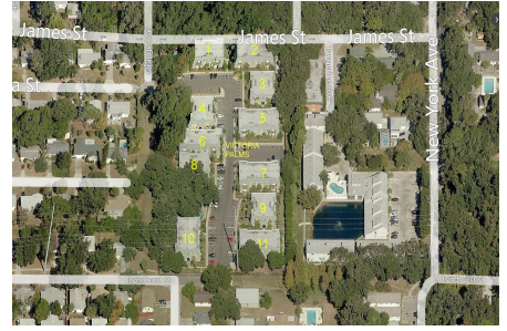
Built in 1974 - 88 units - 2 floors

Victoria Palms of Dunedin Condominium Association Address: 700 Lyndhurst St, Dunedin, FL 34698, Phone: +1 727-734-0319 http://victoriapalmshoa.com/