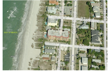
Built in 2005 - 18 units - 4 floors

SCOPELLO CONDOMINIUM ASSOCIATION, INC. LEADING EDGE COMMUNITY ASSOCIATION MANAGER 901 N HERCULES AVE STE A CLEARWATER FL 33765 PHONE 727-461-9770 FAX 727-461-9775 EMAIL SERVICE@LEADINGEDGE.COM