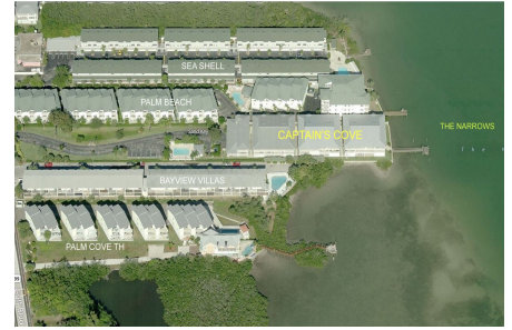
Built in 2002 - 27 units - 2 floors

Number of units: 27 Number of active listings for rent: 0 Number of active listings for sale: 3 Building inventory for sale: 11% Number of sales over the last 12 months: 4 Number of sales over the last 6 months: 2 Number of sales over the last 3 months: 2