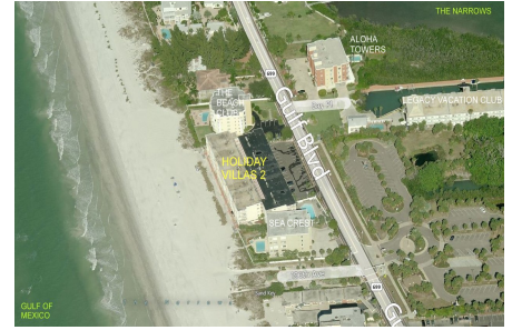
Built in 1973 - 72 units - 4 floors

HOLIDAY VILLAS II, CONDOMINIUM, INC. 7300 PARK STREET SEMINOLE FL 33777 5901 SUN BLVD ST PETERSBURG FL PHONE 727-581-2662 FAX 727-584-2118