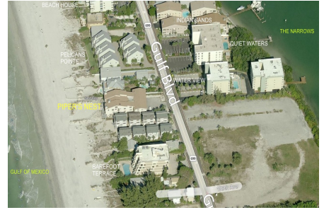
Built in 1979 - 10 units - 3 floors

Number of units: 10 Number of active listings for rent: 0 Number of active listings for sale: 0 Building inventory for sale: Number of sales over the last 12 months: 0% Number of sales over the last 6 months: 1 Number of sales over the last 3 months: 0