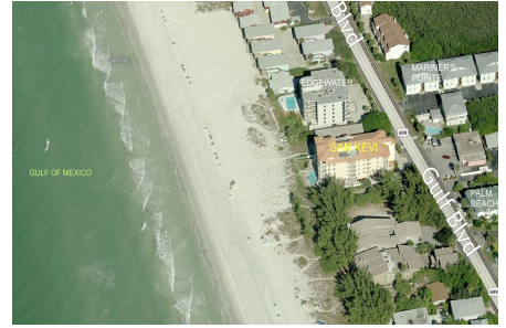
Built in 2006 - 8 units - 5 floors

SAN KEVI CONDOMINIUM ASSOCIATION, INC. S/3 CONSULTING GROUP 19534 GULF BLVD # 202 INDIAN SHORES FL 33785 727-593-1420