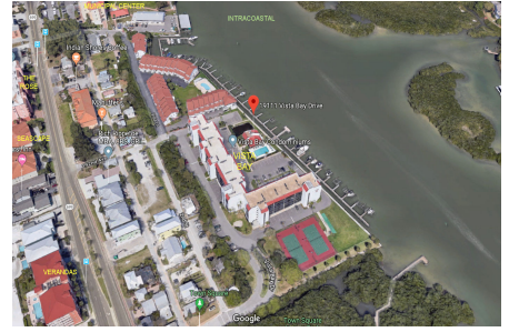
Built in 1983 - 75 units - 6 floors

Vista Bay Condo Association 19111 Vista Bay Drive # 507 Indian Shores, FL 33785 Phone: (727) 596-8009