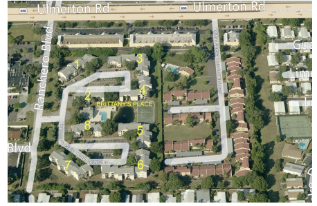
Built in 1987 - 96 units - 2 floors

BRITTANY'S PLACE CONDOMINIUM ASSOCIATION, INC. AMERI-TECH REALTY INC 24701 US HIGHWAY 19 N STE 102 CLEARWATER FL 33763 PHONE 727-726-8800 FAX 727-723-1101