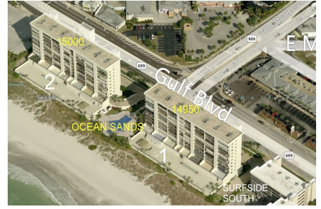
Built in 1981 - 80 units - 12 floors