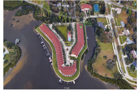
Built in 2003 - 67 units - 3 floors