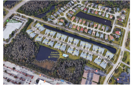
Built in 1998 - 78 units - 2 floors

Number of units: 78 Number of active listings for rent: 0 Number of active listings for sale: 0 Building inventory for sale: Number of sales over the last 12 months: 0% Number of sales over the last 6 months: 0 Number of sales over the last 3 months: 0