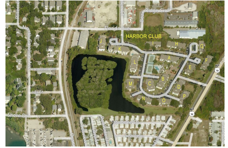
Built in 1985 - 272 units - 2 floors

Harbor Club Condominium Association Address: 455 Alt 19, Palm Harbor, FL 34683 Phone:(727) 786-6864 http://www.harborclub-palmharbor.com/