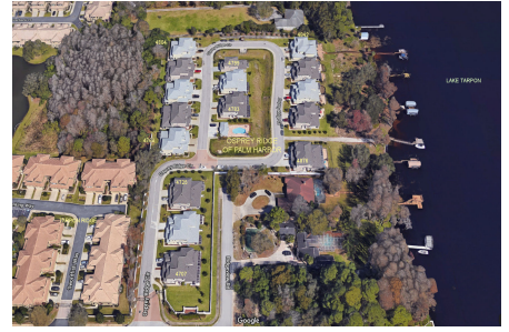
Built in 2013 - 31 units - 2 floors

Osprey Ridge of Palm Harbor Homeowners Association 4707 Osprey Ridge Cir, Palm Harbor, FL 34684 (727) 943-809