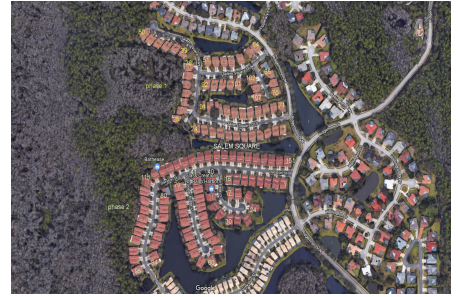
Built in 1991/2000 - 258 units - 1 floor

Number of units: 258 Number of active listings for rent: 0 Number of active listings for sale: 0 Building inventory for sale: Number of sales over the last 12 months: 0%% Number of sales over the last 6 months: 0 Number of sales over the last 3 months: 0