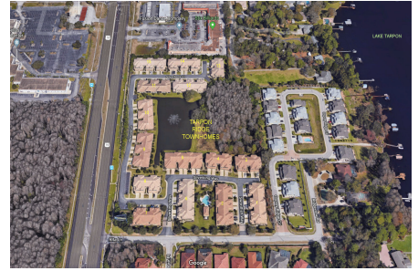
Built in 2007/2013 - 80 units - 2 floors