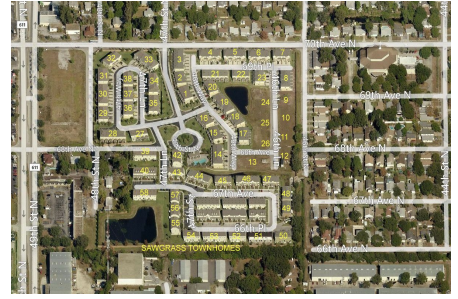
Built in 2005 - 307 units - 2 floors

Sawgrass Village HOA, Inc. c/o Leland Management, Inc. 6972 Lake Gloria Blvd. Orlando, FL 32809-3200 Sawgrassmaster@gmail.com (727) 451-7909 http://www.sawgrassvillage.org/sawgrassvillage/home.asp