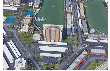
Built in 1980 - 94 units - 18 floors

Bay Island Group Address: 7490 Bay Island Dr S, South Pasadena, FL 33707 Phone: +1 727-360-2751