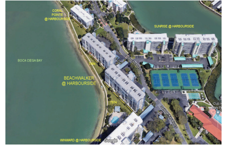
Built in 1988 - 108 units - 9 floors