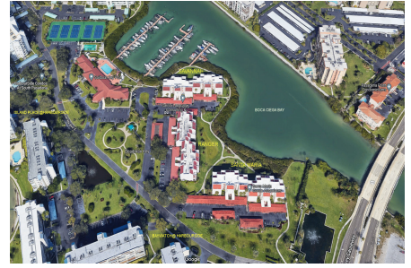
Built in 1982 - 32 units - 4 floors

HarbourSide Condos At South Pasadena Address: 7886-7970 Sailboat Key Blvd S, South Pasadena, FL 33707 Phone: +1 727-367-6008