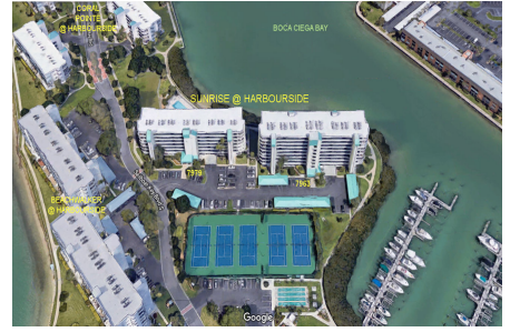
Built in 1989 - 108 units - 9 floors

Number of units: 108 Number of active listings for rent: 0 Number of active listings for sale: 3 Building inventory for sale: 2% Number of sales over the last 12 months: 7 Number of sales over the last 6 months: 5 Number of sales over the last 3 months: 3