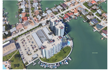
Built in 1974 - 197 units - 13 floors

Three Palms Pointe Condos Address: 420 64th Ave # 107E, St Pete Beach, FL 33706 Phone: +1 727-367-3650