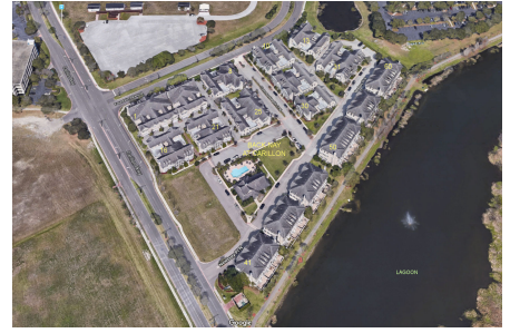
Built in 2007 - 55 units - 3 floors

Number of units: 55 Number of active listings for rent: 0 Number of active listings for sale: 3 Building inventory for sale: 5% Number of sales over the last 12 months: 1 Number of sales over the last 6 months: 1 Number of sales over the last 3 months: 1