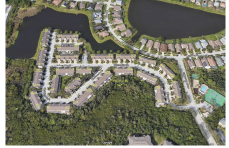
Built in 2002 - 150 units - 2 floors