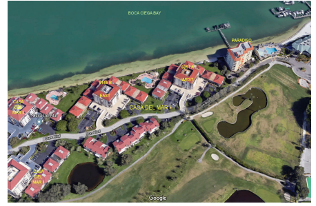
Built in 1977 - 128 units - 6 floors

Casa del Mar 1 Condominium Association Inc 9887 4th Street North Saint Petersburg, FL 33702